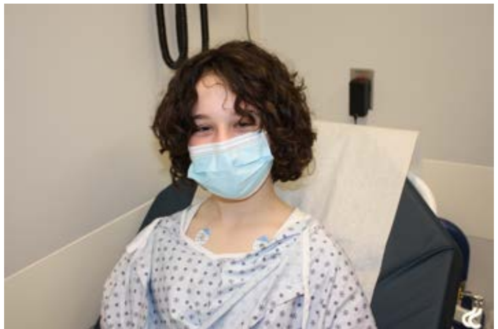
Heart Monitor Leads

The team may also place three round stickers called heart monitor leads on your chest. These stickers listen to your heart beat and follow your breathing during the procedure.