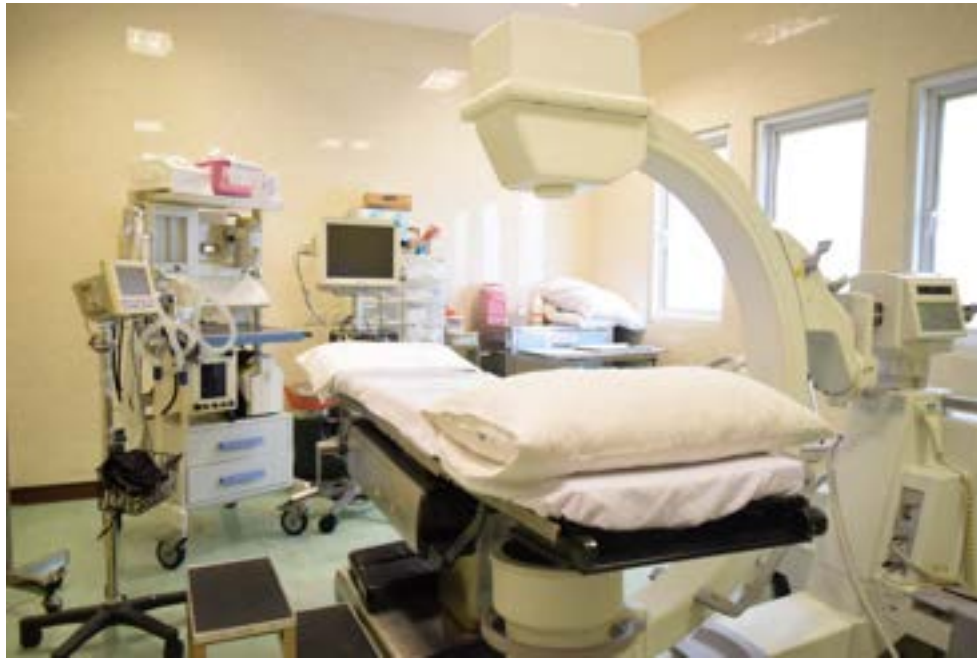
C-Arm Machine for X-Ray

Depending on where they want to put the medication for the block, we may use the following equipment to better locate the area: a C-arm machine for X-ray or an ultrasound .